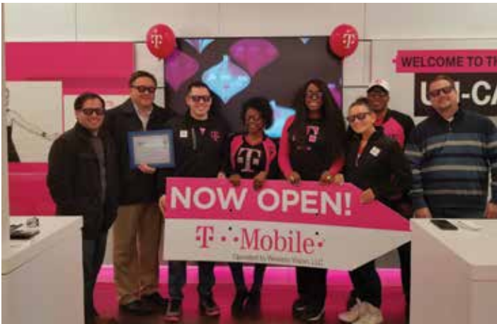
T-Mobile celebrates the grand opening of a new store at 4105 W. Genesee St. in Syracuse.