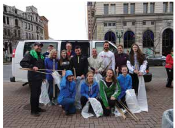
The 2017 Downtown Committee Earth Day Cleanup attracted 402 volunteers. Several downtown organizations assembled volunteers to join the effort, including representatives from BlueRock Energy, pictured here.