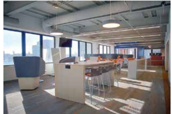
Energy solutions company BlueRock Energy recently moved its local headquarters into downtown Syracuse. The company now occupies the entire eighth floor of the Barclay Damon Tower.

In the last year, BlueRock Energy expanded its workforce in the Syracuse area, resulting in the need for larger office headquarters. In March 2017, BlueRock Energy moved from Franklin Square to the center of downtown Syracuse, where it now occupies the entire eighth floor of the Barclay Damon Tower. The new 13,828-square-foot space gives BlueRock's 82 employees a more collaborative environment with room for continued growth.