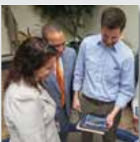
CenterState CEO Events