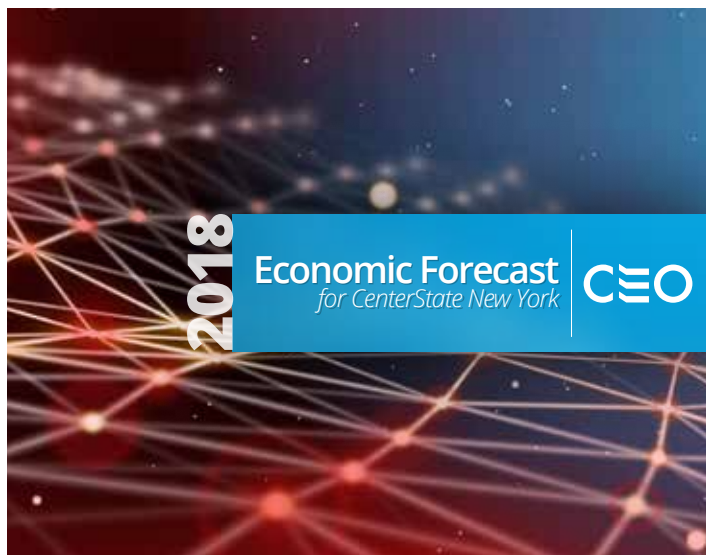
Download the 2018 Economic Forecast report at https://goo.gl/jnGdR6 .