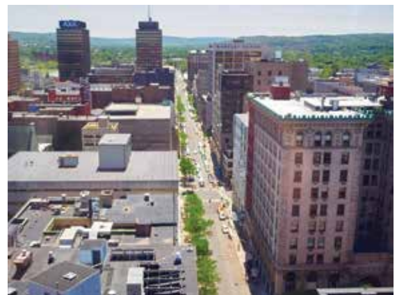
Salina and Warren streets in downtown Syracuse are the focus of a recently awarded $500,000 New York Main Street Grant.

For more information about the Downtown Committee and its programs and services, please visit www.DowntownSyracuse.com .