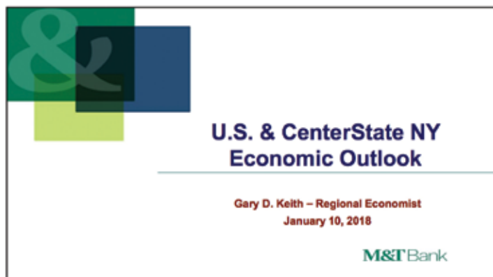
See Gary Keith's presentation at https://goo.gl/DyCACx .