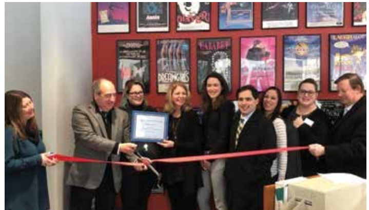
Famous Artists cuts the ribbon at its new location at 374 S. Salina St. in Syracuse.