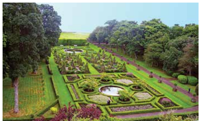
The gardens of Dunrobin Castle in Scotland.