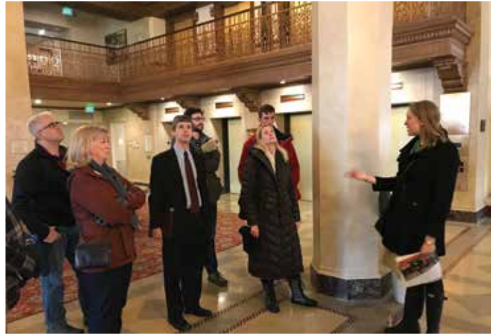
GENIUS NY 2.0 teams get a tour of the Marriot Syracuse Downtown, where their Finals Night will be held April 12. The teams will pitch in front of a live audience and panel of judges that will award $3 million in prizes, including a $1 million grand prize.