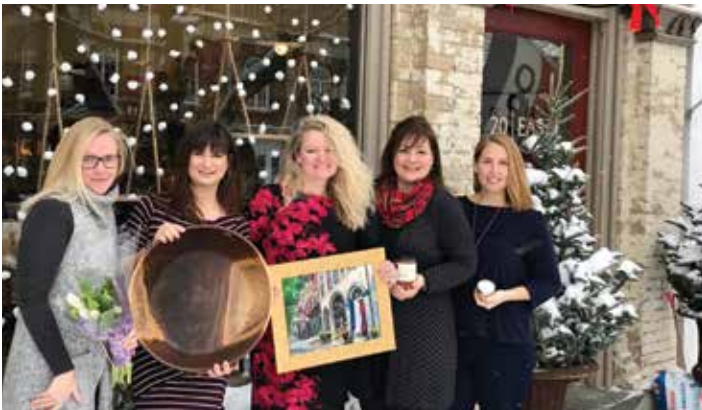
20|East , 85 Albany St., Cazenovia, celebrates its new location and its collaboration with Cazenovia Cut Block.