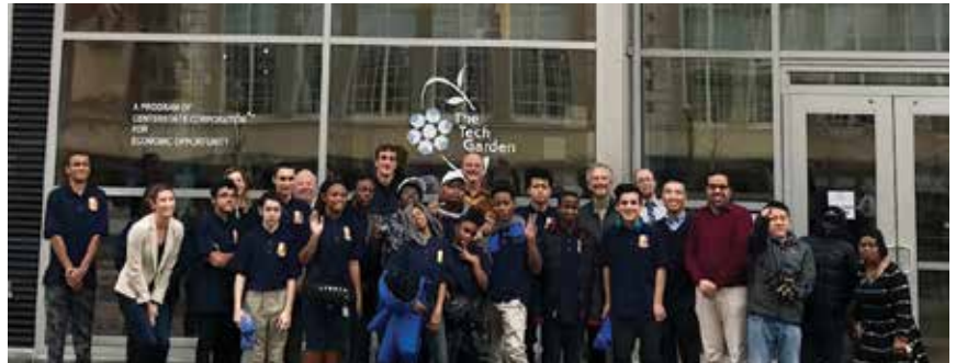
Students from Fowler's PSLA pose with GENIUS NY teams and Tech Garden staff while flying a drone.