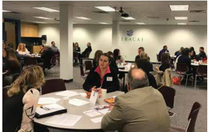
Attendees maximize their time and the number of contacts made during Speed Networking.

See the events calendar on page 22 for upcoming opportunities to learn from fellow members and improve your business.