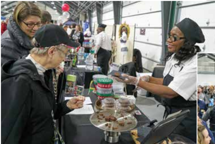
Henry's Cake shares a taste of its Jamaican Rum Cake.