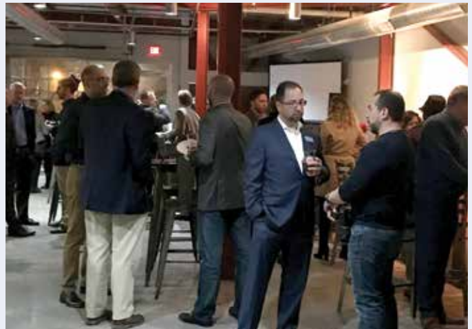
Attendees enjoy connecting with CenterState CEO members at The Rail Line.

See upcoming CenterState CEO events on 22 or visit www.centerstateceo.com/events .