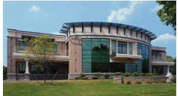
Liberty Resources with its headquarters in Syracuse, now employs more than 1,400 people.

LIBERTY RESOURCES Improving Lives, Building Futures