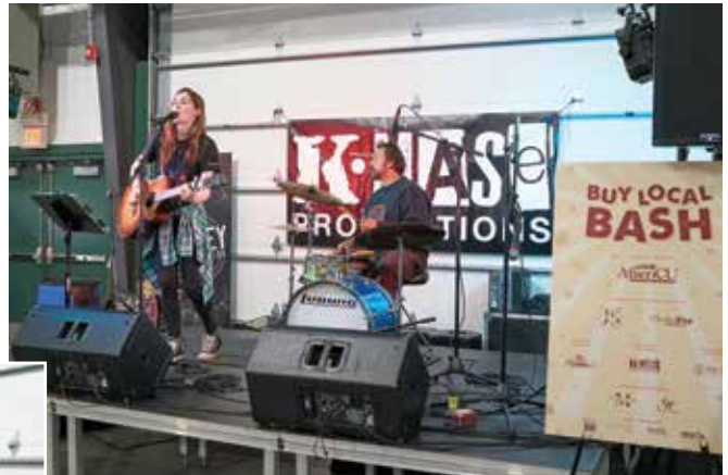
Buy Local Bash attendees enjoyed live entertainment provided by KMase Productions.

The Buy Local Bash wouldn't be possible without the support of its sponsors: AmeriCU (Presenting Sponsor); ChoicePay Payroll and That Insurance Girl (Neighborhood Champion Sponsors); KMase Productions (Local Music Sponsor); The Lab Creative (Local Agency Sponsor); Peppino's Restaurant & Catering (Bar Sponsor); The Marrone Law Firm and CH Insurance (Sustainable Business Sponsors); Galaxy Media/KROCK (Radio Sponsor); WSYR/News Channel 9 (TV Sponsor); WAER and Syracuse Woman magazine (Media Sponsors).