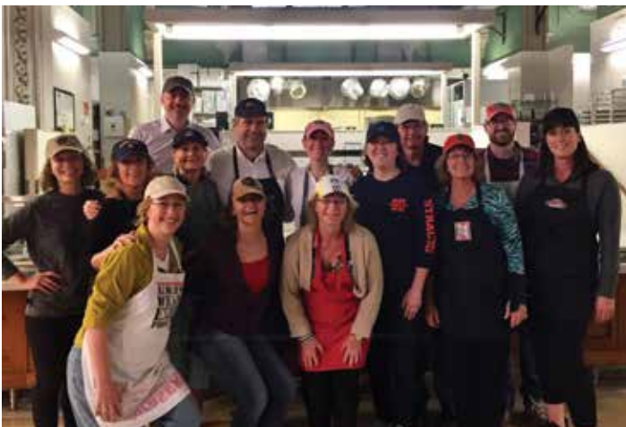
CenterState CEO staff serves meals and cleans at the Samaritan Center.