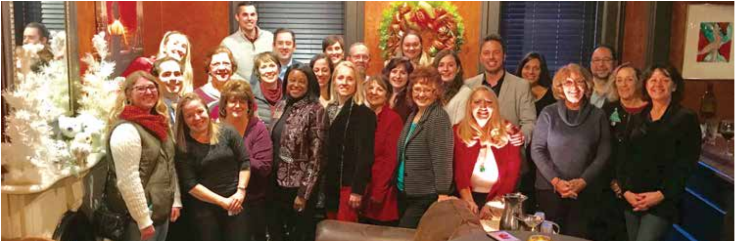
CenterState CEO Ambassadors enjoy a holiday celebration at Laci's Tapas Bar . Thank you to del Lago Resort & Casino and Greek Peak Mountain Resort & Cascades for prize donations. In the spirit of giving, the Ambassadors donated more than $600 to the Salvation Army .