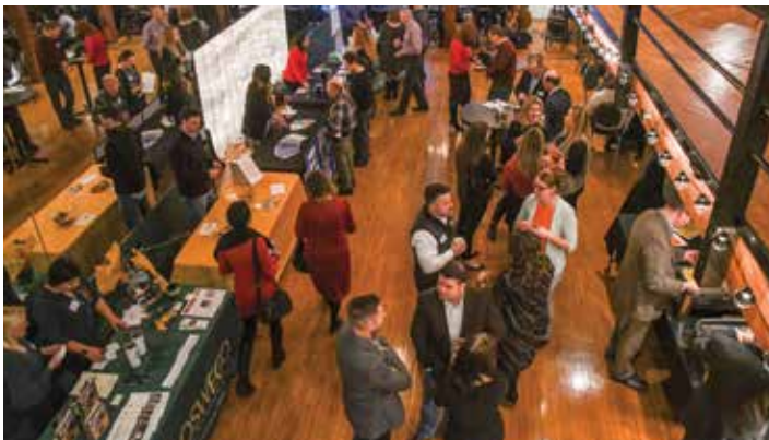
The crowd enjoyed live music by The Cortini Brothers as they networked and visited member tabletop displays.