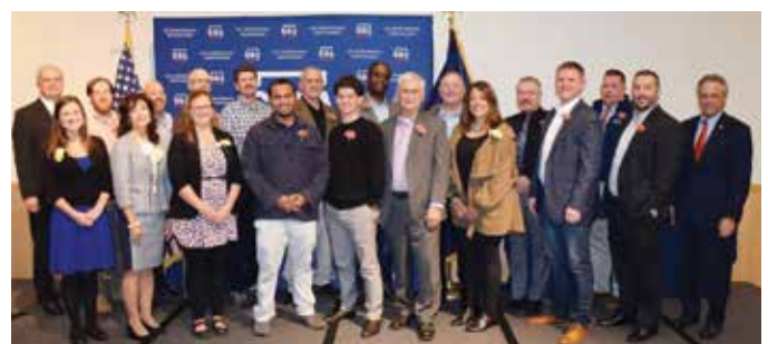
Congratulations U.S. Small Business Administration 2018 Emerging Leaders graduates.

To learn more about the SBA's Emerging Leaders Initiative, contact emergingleaders@sba.gov or visit www.sba.gov/offices/district/ny/syracuse .