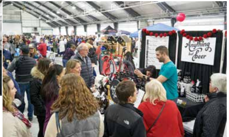
Attendees enjoy samples from Anything But Beer – brewers of grain and gluten-free fruit ales that are made from locally sourced fruits and vegetables. www.anythingbutbeer.com