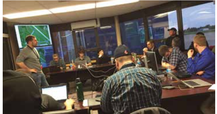
UAS collaborators debrief after the first-of-its-kind ACAS sXu mission at Griffiss International Airport in Rome, NY.