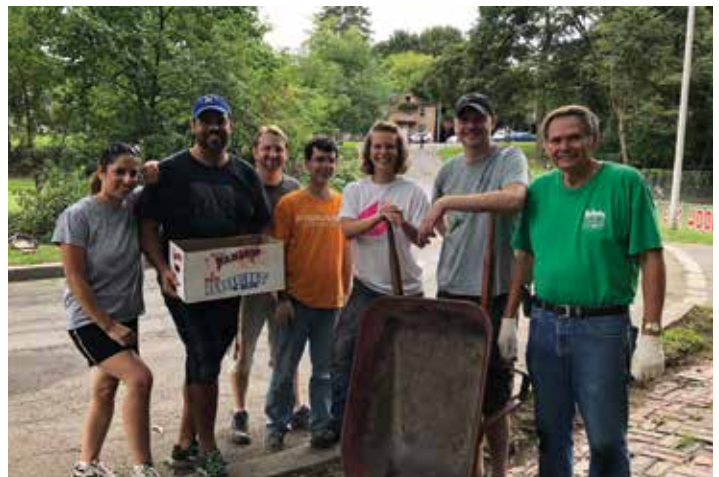
CenterState CEO staff support Home HeadQuarters' annual Block Blitz to help improve and beautify the Elmwood Park neighborhood of Syracuse.