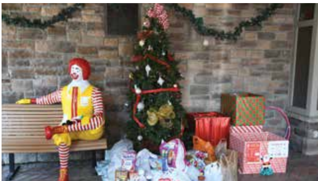
CenterState CEO supports the Ronald McDonald House annual Christmas in July event with donations of household goods and food items.

CenterState CEO believes that communities prosper when we all work together, and looks forward to continuing its role as a strong community partner in the year ahead. If your business is looking for opportunities to get involved in one of the countless charitable or nonprofit organizations working to create greater prosperity in Central New York, visit our member directory at https://goo.gl/Z5S9tU .