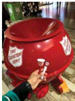
This year's holiday giving supported the Salvation Army's Red Kettle Bell Ringing Campaign. Staff donated nearly 200 items to the Salvation Army to support local families in need.