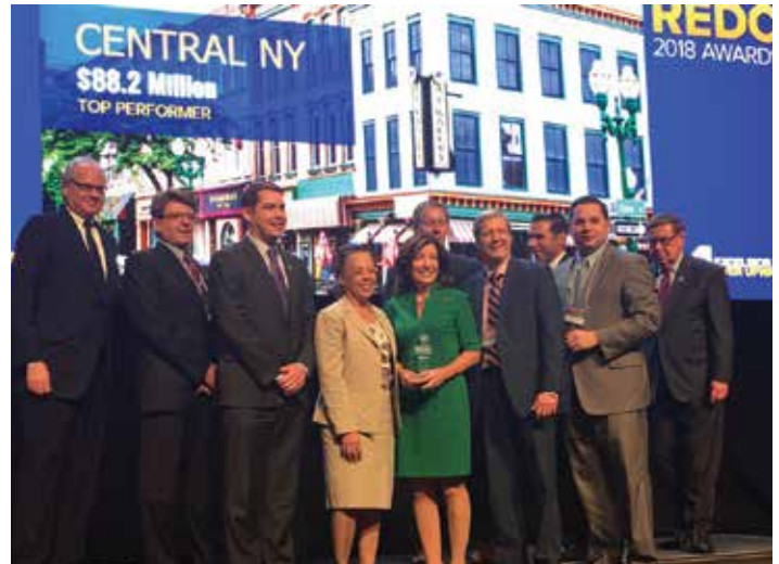
Members and supporters of the CNY Regional Economic Development Council celebrate winning the state’s largest investment out of all 10 councils — $88.2 million to fund 91 projects.