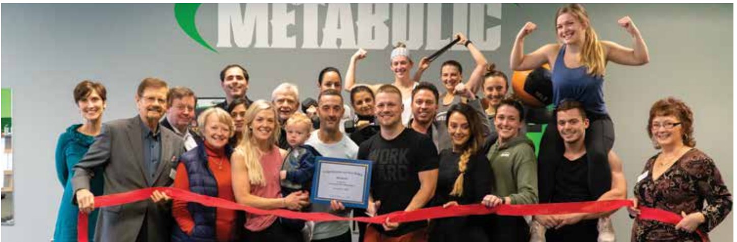
Metabolic , a new fitness facility, has opened in Liverpool at 7608 Oswego Road.