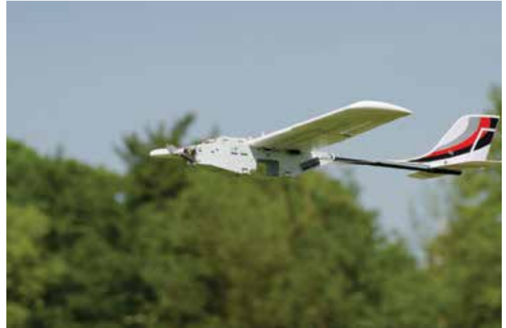
NUAIR Alliance is working with PrecisionHawk to test UAS for use in precision agriculture.