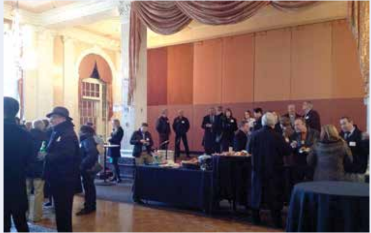
Dozens of CEO Investors attended the Delta High Altitude Business After Hours event at the Hotel Syracuse. The gathering was held in the hotel's Persian Terrace, which is currently being renovated.