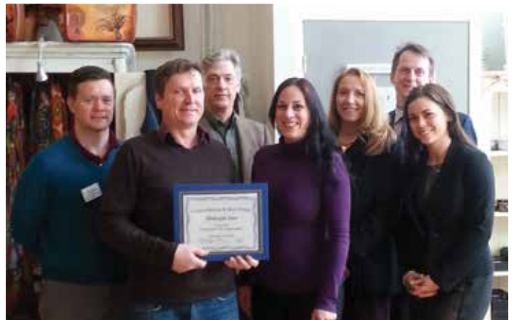
Midnight Sun , located at 406 S. Franklin St. in Armory Square, celebrates its grand opening with CenterState CEO Ambassadors.

Make-A-Wish Foundation of CNY , 5005 Campuswood Drive in East Syracuse, 30th Precision Systems Manufacturing Inc. , 4855 Executive Drive in Liverpool, 1st