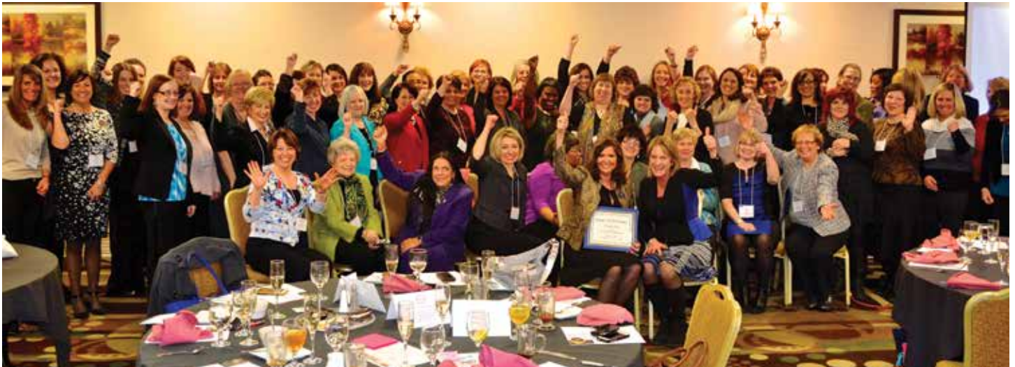
Women Ties celebrates its 10 th anniversary at Maplewood Inn & Suites. CenterState CEO Ambassadors presented the group with a certificate in recognition of the milestone.