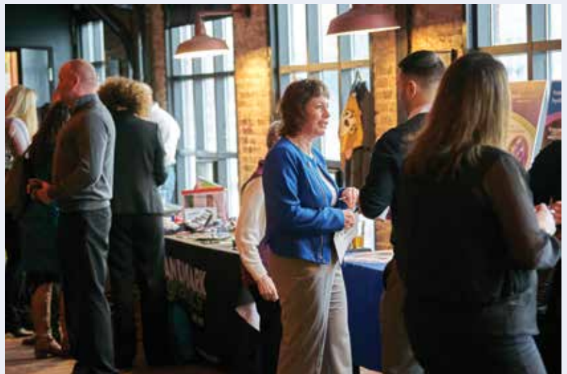
CenterState CEO members make new contacts and exchange information during the Business After Hours and Member Showcase at Dinosaur Bar-B-Que.