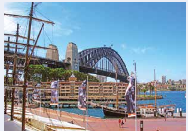
Sydney Harbour Bridge, Australia

For additional trip information or to RSVP, please contact Shannon Fults at 315-470-1884 or sfults@centerstateceo.com