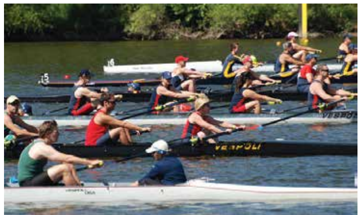
Hundreds of rowers are expected to compete in the USRowing Northeast/Mid-Atlantic Masters Regional Championships, June 28, on Onondaga Lake.