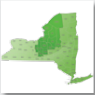
2015 CenterState CEO Legislative Agenda

CenterState CEO's 2015 Annual Meeting provided a fitting opportunity to reflect on the organization's five successful years of implementing a holistic and integrated approach to economic development, while exploring the theme of Evolve: Progress through Continuous Innovation .