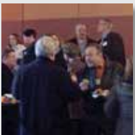
CenterState CEO Events