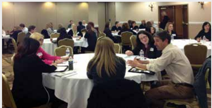
CenterState CEO members attend a new and improved Speed Networking event, hosted at Maplewood Inn & Suites. Speed Networking is a great opportunity to interact with professionals in a small group and comfortable setting.