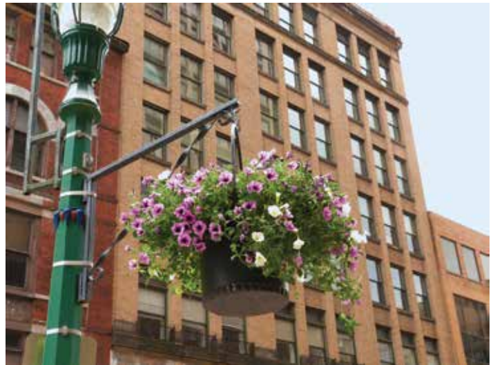
Sponsor one of the hundreds of hanging flower baskets in downtown Syracuse with a $45 donation to the Downtown Committee.

Hanging Flower Baskets: Each June, the Downtown Committee's hanging flower baskets help beautify the city. Last year, a record 334 baskets were installed in Cathedral Square, Hanover Square, Salina Street, Clinton Square and Armory Square. This June will mark the program's fifth anniversary. You can support the effort by sponsoring a basket with a tax-deductible donation of $45 per basket. Checks may be mailed to the Downtown Syracuse Foundation, Inc. at 115 W. Fayette St., Syracuse. Credit cards can also be used to make a donation at www.downtownsyracuse.com/get-involved/downtown-beautification .