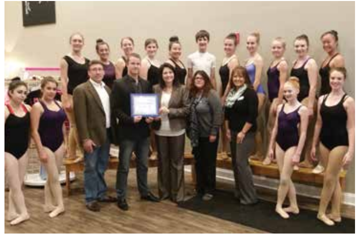
CMC Dance Company , located at 6092 Route 31 in Cicero, celebrates its recent expansion.