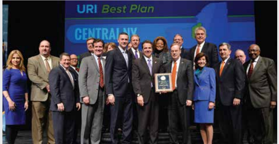
Members of the CNY Regional Economic Development Council join elected officials and Gov. Andrew Cuomo after being named a URI $500 million Best Plan Awardee.

The Central New York region has been named an Upstate Revitalization Initiative (URI) Best Plan Awardee for its strategic plan, CNY Rising. The region will receive $500 million over five years, in addition to economic development funds announced through Round 5 of Gov.