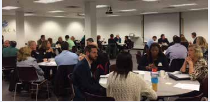
Dozens of CenterState CEO members attend a recent Speed Networking event at TERACAI to connect with other local business leaders.

More than 50 business professionals attended the recent Speed Networking event at TERACAI in North Syracuse. The event was a tremendous opportunity to engage in small group dialogue and make connections with CenterState CEO members. The event included informal networking and an opportunity to share a brief pitch with others. Café Kubal provided refreshments. Check www.centerstateceo.com for upcoming networking and business opportunities.