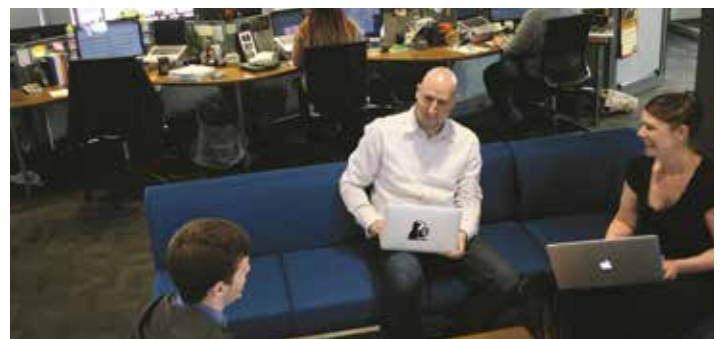
Terakeet (left) and Ascension Gaming Network Inc. (right) will receive Round 5 Regional Economic Development Council funding to expand operations and grow their workforce.