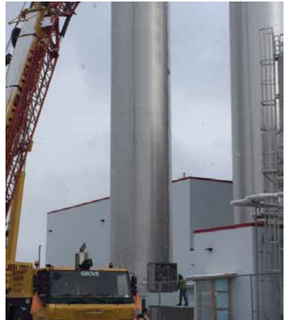
Cayuga Milk Ingredients, which has invested more than $106 million in its facility outside Auburn, recently completed a $4 million expansion and plans to add another milk silo soon.