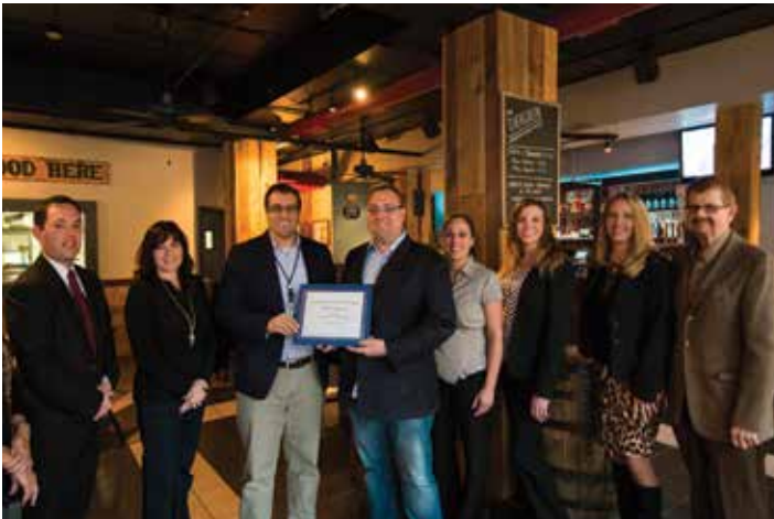
The Evergreen restaurant opens at 125 E. Water St., Syracuse.