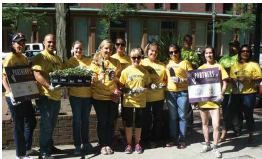
Young Leaders United plant flowers in downtown Syracuse.

Hanging Flower Basket Program: June 2015 marks six years since its inception. Last year, 334 baskets were installed throughout Cathedral, Clinton, Hanover and Armory squares and the heart of downtown. Basket sponsorship is available with a tax-deductible donation of $50 per basket. Checks may be mailed to the Downtown Syracuse Foundation, Inc. at 115 W. Fayette St., Syracuse, NY 13202 or pay by credit card at: http://downtownsyracuse.com/flowers