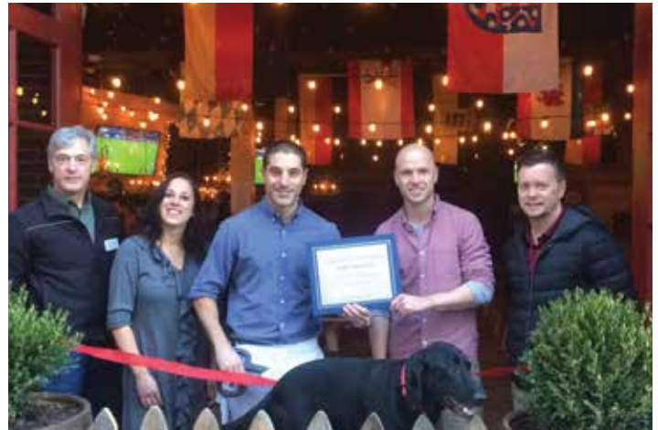
Wolff's Biergarten , 106 Montgomery St., hosts a grand opening celebration.