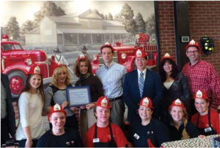
Firehouse Subs opens its first local location at 5308 W. Genesee St. in Camillus.