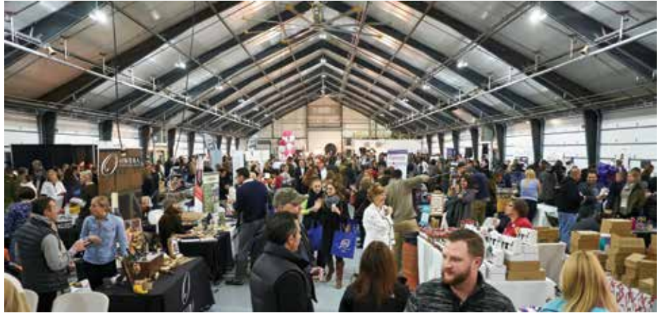
More than 750 people attend the sixth annual Buy Local Bash at the F Shed of the Regional Market.

The annual event brings community members and local merchants together for a one-of-a-kind social, shopping and tasting event to highlight the locally owned, independent businesses of Central New York. This unique and festive event spreads awareness and support for SyracuseFirst's mission of educating the community about the importance of buying local, and kicks off Buy Local Month, which supports local businesses during the holidays.