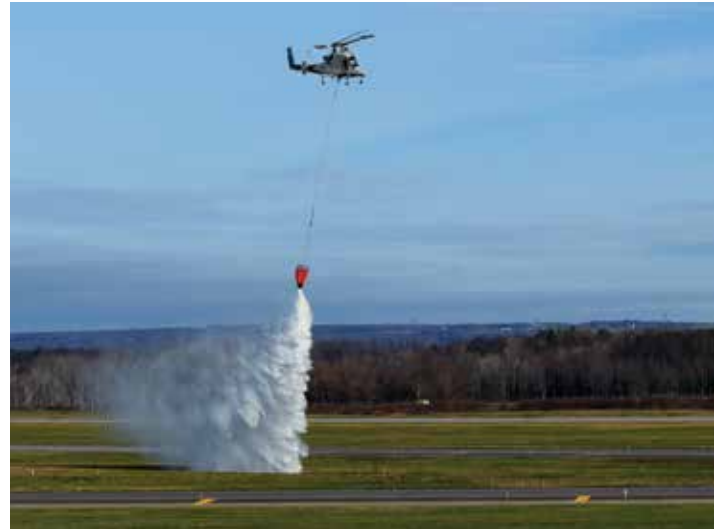
Lockheed Martin demonstrates its unmanned K-MAX cargo helicopter, which conducted water drops to extinguish a fire. Its stable, high-definition imaging capabilities enable day and night firefighting operations.

This is the second time Lockheed has tested its ability to aid in aerial firefighting operations at the New York UAS Test Site managed by the NUAIR Alliance. Visit www.nuairalliance.org for up-to-date information on UAS testing being conducted in New York, Massachusetts and Michigan. The mission of the NUAIR Alliance is to safely integrate UAS into the national airspace.