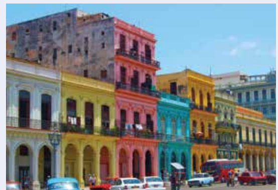
Havana, Cuba is known for its colorful sights. Attend a travel presentation on January 11 to Rediscover Cuba!

For more information, attend a travel presentation at 5:30 p.m. on January 11, 2016 at the Maplewood Suites Extended Stay, 400 7th North St. in Liverpool. RSVP to 315-701-2648 to attend.