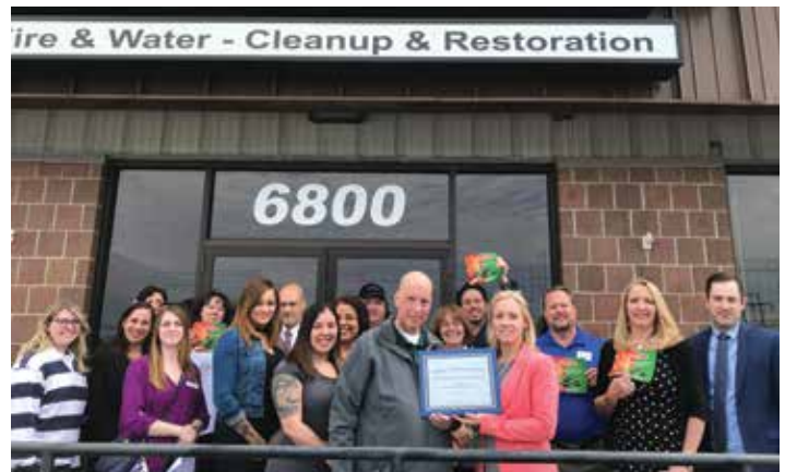
SERVPRO of North Onondaga County and Oswego County , 6800 Northern Blvd. in East Syracuse, celebrates its 25th anniversary.