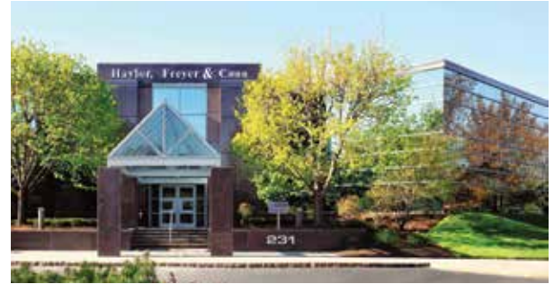
Haylor, Freyer & Coon recently expanded to open an office in the Capital District, which complements offices across New York state.

This feature of CEO Essentials spotlights local companies that are "Economic Champions" because of their success in adding jobs, expanding their products or services, gaining national recognition or contributing to the success of the region in special ways.