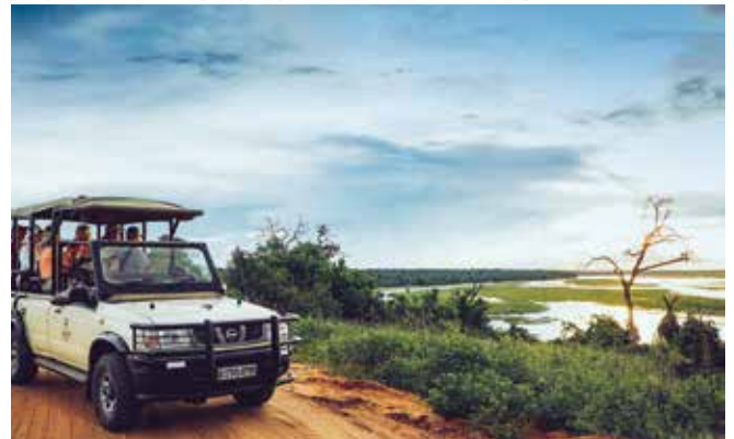
The spectacular South Africa trip includes a safari game drive like the one above.

Join CenterState CEO on a trip to spectacular South Africa, February 21 to March 5, 2019. Highlights include Johannesburg, Soweto, Kruger National Park, a safari game drive, Knysna, Featherbed Nature Reserve, an ostrich farm visit, winery lunch and tasting, Cape Town, Table Mountain and more! Per person rates, if booked by August 22, 2018, are: $4,999 (double) and $5,649 (single). Prices include 21 meals, round-trip air from Syracuse Hancock International Airport, air taxes and fees/surcharges and hotel transfers. Optional post-tour extensions available. AAA members receive an additional $50 off per person. For more information, contact Jennine Lombardi at 315-701-2648 or jlombardi@nyaaa.com .