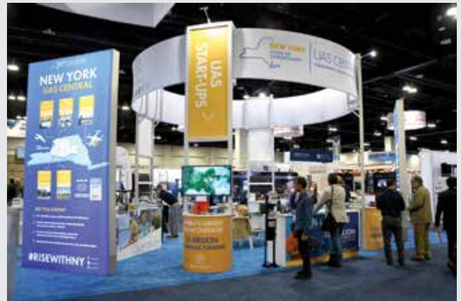
Attendees visit the prominent UAS Central booth at AUVSI Xponential 2018 to learn about the region's efforts to advance UAS integration in the National Airspace System.