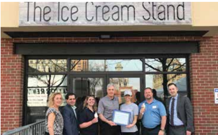
The Ice Cream Stand celebrates its grand opening in the Amos Building, 200 W. Water St. in downtown Syracuse.