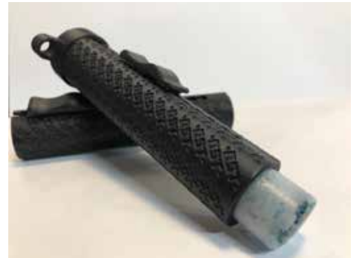
Battle Sight Technologies has created the MARC to enable enhanced communication options in low-light and no-light conditions.