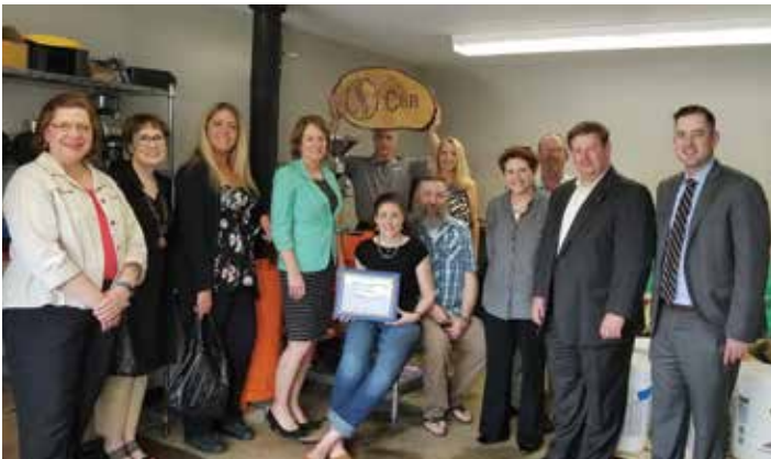
Cracked Bean Roastery celebrates its grand opening at 4675 Brickyard Falls Road in Manlius.