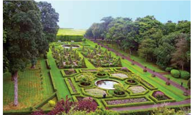
The gardens of Dunrobin Castle in Scotland.