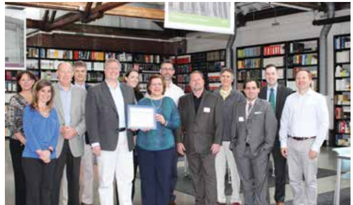
Staff at King + King Architects LLP , 385 W. Jefferson St. in Syracuse, celebrate its 150th anniversary. King + King is the oldest architecture firm in New York state and the third oldest in the nation!