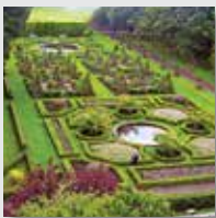
Make Scotland Your Next Adventure