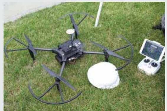
GENIUS NY—the world's largest business accelerator competition for unmanned aerial systems—prepares for round 2.0 in 2018. Pictured is an AutoModality drone. AutoModality won $1 million in the inaugural GENIUS NY competition to advance its UAS technologies.