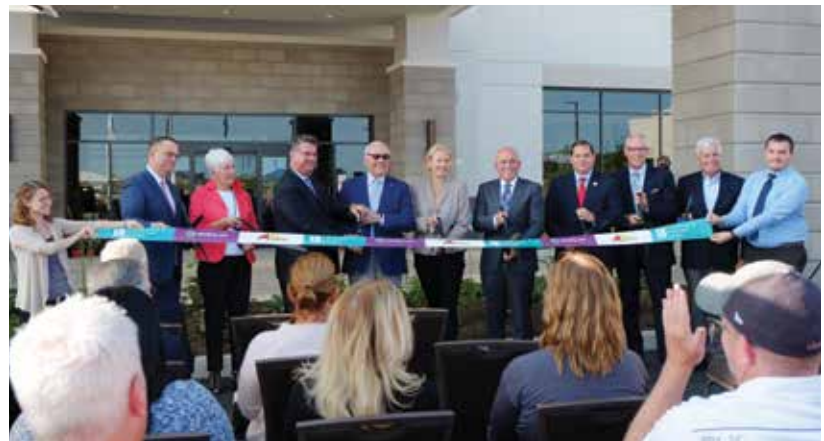
Community leaders and elected officials cut the ribbon at the grand opening of the Embassy Suites by Hilton Syracuse—Destiny USA.

Embassy Suites by Hilton Syracuse Destiny USA is located 311 Hiawatha Blvd. W. For more information or to make a reservation, travelers may visit embassysuites.com or call 315-303-1650.