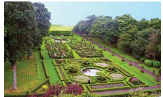
The gardens of Dunrobin Castle in Scotland.