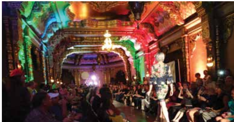
The Landmark Theatre provided the perfect backdrop for Syracuse Fashion Week.

The Downtown Committee would like to thank the participating retailers and salons for their participation in the event, which raises downtown Syracuse's profile as a retail destination: