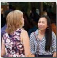
CenterState CEO Events