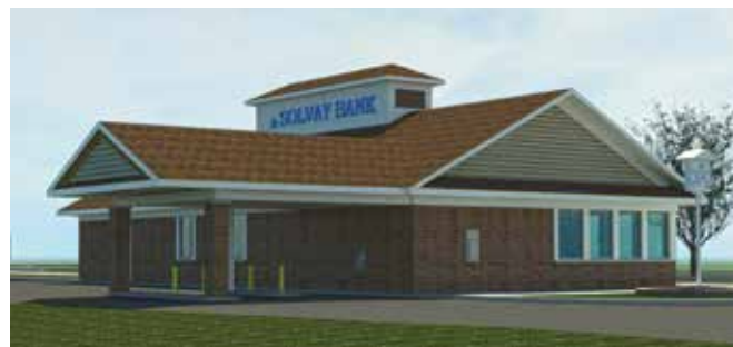
A rendering of Solvay Bank's Baldwinsville office at 197 Downer Street, the bank's 10th branch location. It is slated to open later in 2017.

Solvay Bank was established on March 17, 1917 as a way for Solvay Process employees to easily cash checks and access other bank services. It quickly became a pillar in the community and its reputation as a reliable financial partner spread across Onondaga County. In 1981, the bank began expanding its branch network beginning in Westvale and later established offices in Camillus, downtown Syracuse in the State Tower Building, Fairmount, North Syracuse, Liverpool, Cicero and DeWitt. It also maintains solvaybank.com as its home on the web where customers can find out more about products and services, access their accounts, read about important financial topics and apply for an account or loan.